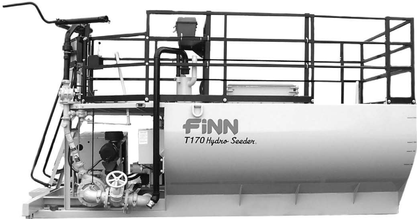
T170 Series II HydroSeeder

The FINN T170 Series II HydroSeeder boasts a top-notch 1,500 gallon tank working capacity engineered to tackle a wide array of mid to larger-sized hydroseeding projects. From large residential and commercial properties, highway roadsides, industrial parks, sports fields, mine reclamation sites and more, the T170 is an economical choice for optimum power, performance and production.